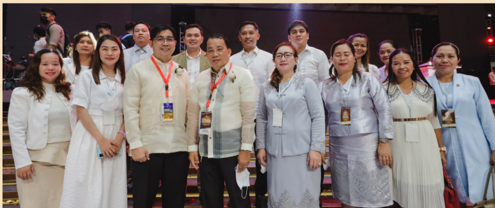
The newly elected officers after their oath-taking and dedication during the 32nd International Convention.